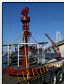
SFFD Fire boat Phoenix , manu- ally operated monitor and noz- zle—to be used as Marina Monument

On October 17, 1989, San Francisco experienced an earthquake with a magnitude of 7.1 on the Richter scale. The aftermath of such an event and its effect on San Francisco's residents led to specific action. The San Francisco Fire Department, prompted by the residents in the city, formed the Neighborhood Emergency Response Team Training Program, which currently provides training in disaster and emergency response. Since 1990 the NERT program has trained more than 11,000 San Francisco residents to be self sufficient in a major disaster. Through this program, individuals will also learn hands-on disaster skills that will help them as members of an emergency response team.