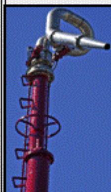
SFFD Fire boat Phoenix , new remotely con- trolled monitor

The Thunder Chief and Mack Hose Tender seen on display here today, are currently part of the SFFD Historic Apparatus Collection, both units were pressed into service in the response to Marina District Fires during the Loma Prieta Earthquake Response.